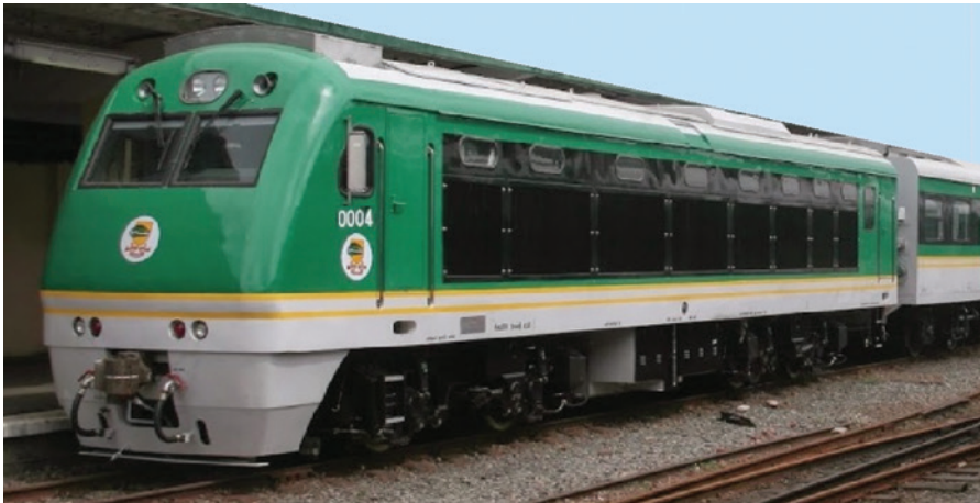
Diesel multiple-unit set in Nigeria.

and financiers will be able to see, in real time, if another party has a claim on the asset about to be purchased or financed.