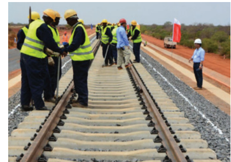
New standard gauge railway under construction in Kenya.

The Luxembourg Rail Protocol was adopted in 2007. The European Union has already ratified the Protocol (in respect of its competences) and a growing number of European countries, as well as countries outside Europe, including South Africa, have either ratified the Protocol or are working towards this. The registry is expected to begin operations in 2017.