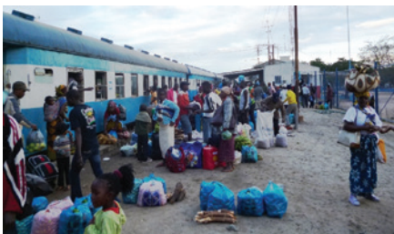
Station scene on Mozambique's Nacala line.

One consequence of this new system is that for the first time in the rail industry, there will be a life-long, unique identifier for each item of rolling stock, issued by the registry and fixed permanently on the asset. This will bring interesting additional industry benefits, facilitating instant asset location tracking as well as helping with insurance issues and accurate maintenance records over the entire asset life.